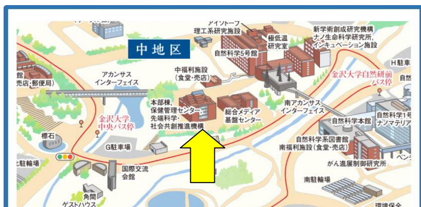
Kakuma Campus Health Service Center